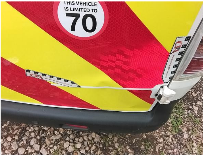
3: Door osr Dented Over 30mm