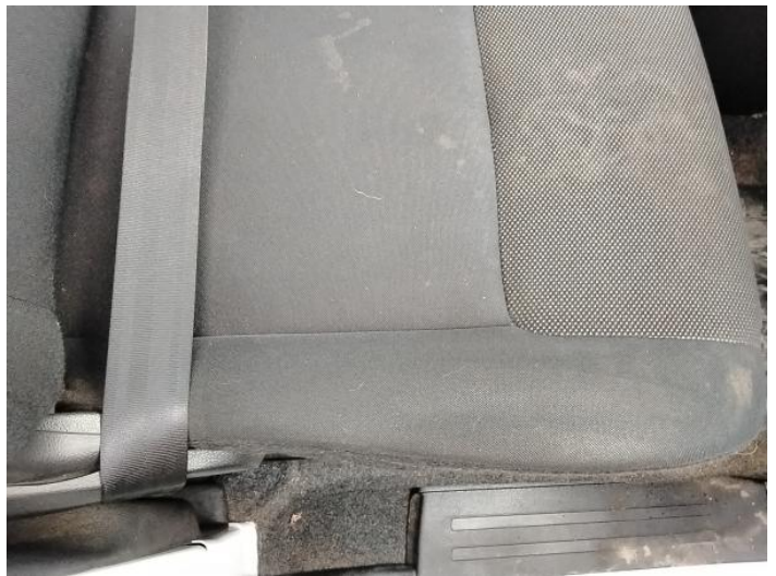
6: Seat Base Cover osf Soiled Heavy