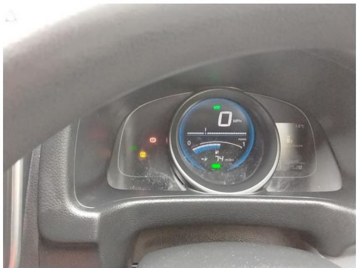
8: Dash Warning Lights Displayed No Action