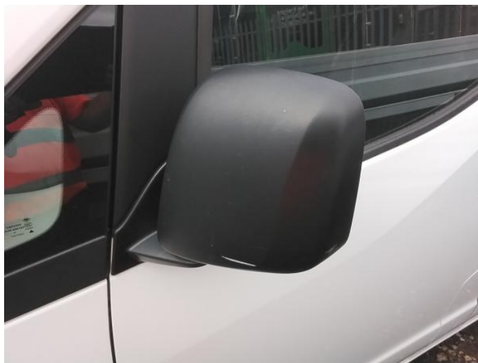
2: Door Mirror Assy nsf Scuffed (Unpainted) UpTo 100mm