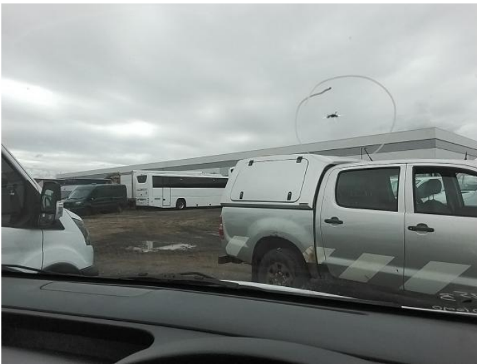
5: Screen Front Cracked Replace