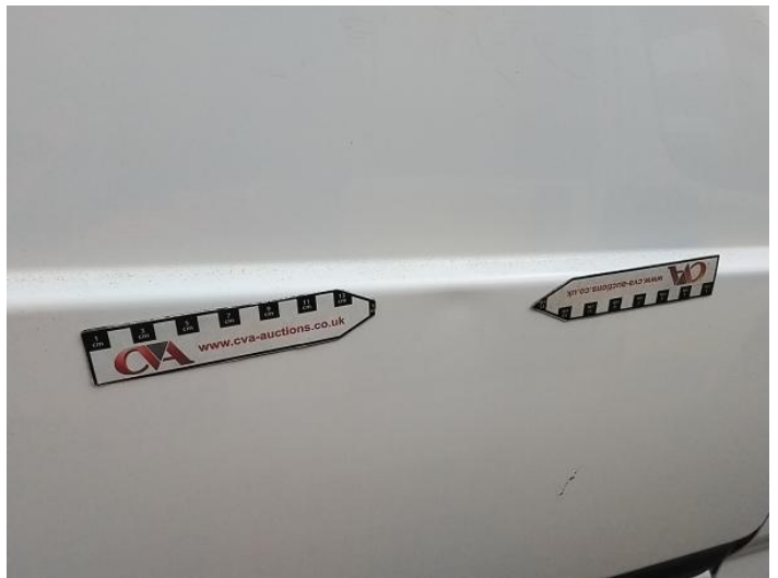
4: Qtr Panel osr Dented Over 30mm