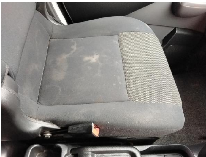
7: Seat Base Cover nsf Soiled Heavy